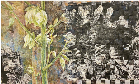
Yucca Blossoms w_ yucca moths